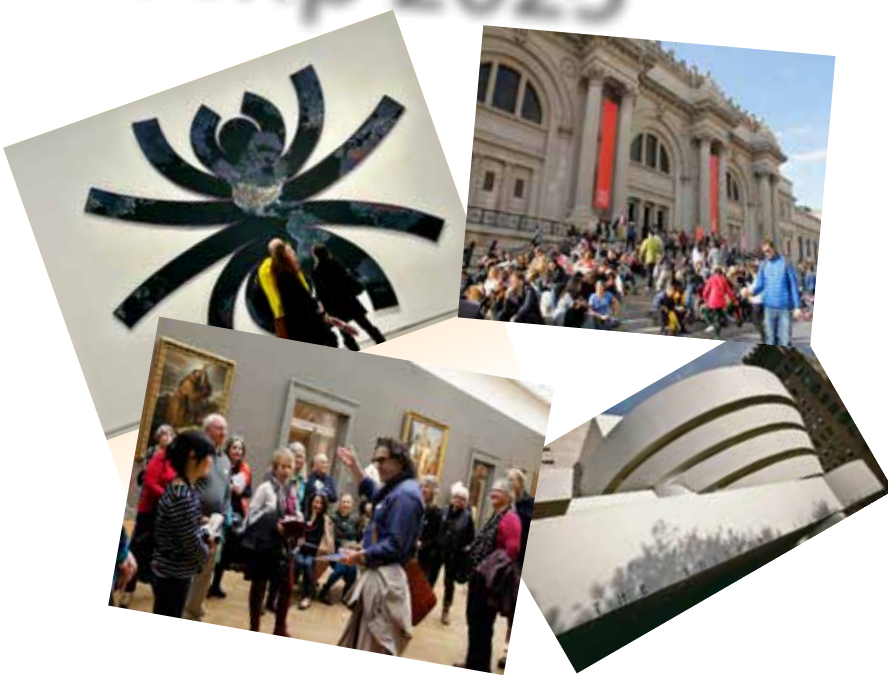
Photo on the cover , at the MoMa during New York Art Trip 2024