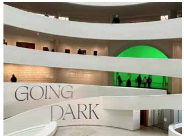
Visiting the Guggenheim during New York Trip 2024

plus the best of contemporary art at the Chelsea Galleries